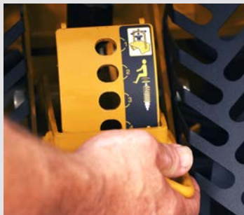
FAST TOOLLESS ONE-HAND ADJUSTABILITY