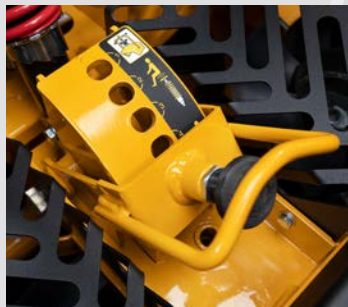
5 LEVELS OF ADJUSTABILITY