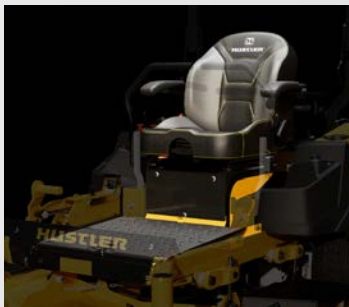
ISOLATED SUSPENSION PLATFORM