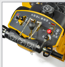
SMOOTHTRAK™ STEERING Responsive, precise steering control.

Hustler's TrimStar® is a perfect addition to any commercial mower fleet. This walk behind zero-turn makes access to hard-to-reach spots easy. In addition, the TrimStar is designed to help reduce operator fatigue. Its wide stance provides maximum stability and its patented H-Bar™ steering makes it a stable, easy-to-control machine. The TrimStar has 20-inch drive tires that provide superior traction. And, its floating deck is easily adjusted from the operator's position.