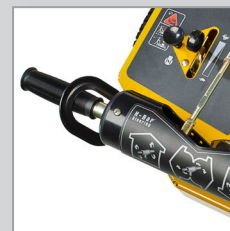
ERGO-DESIGNED CONTROLS Reduces operator fatigue.