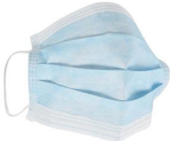
283035 OR Surgical Face Mask