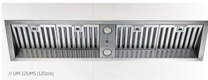
// UM-12UMS (120cm)

With an entirely concealed design, the UM-9S and UM-12UMS stainless steel undermount rangehoods excite those who prefer a fully integrated kitchen, for a continuous flow throughout the space. Powerful silent extraction is delivered with the externally mounted, German engineered Isodrive® motor, producing efficient extraction of steam, smoke and odours, leaving kitchen air fresher.