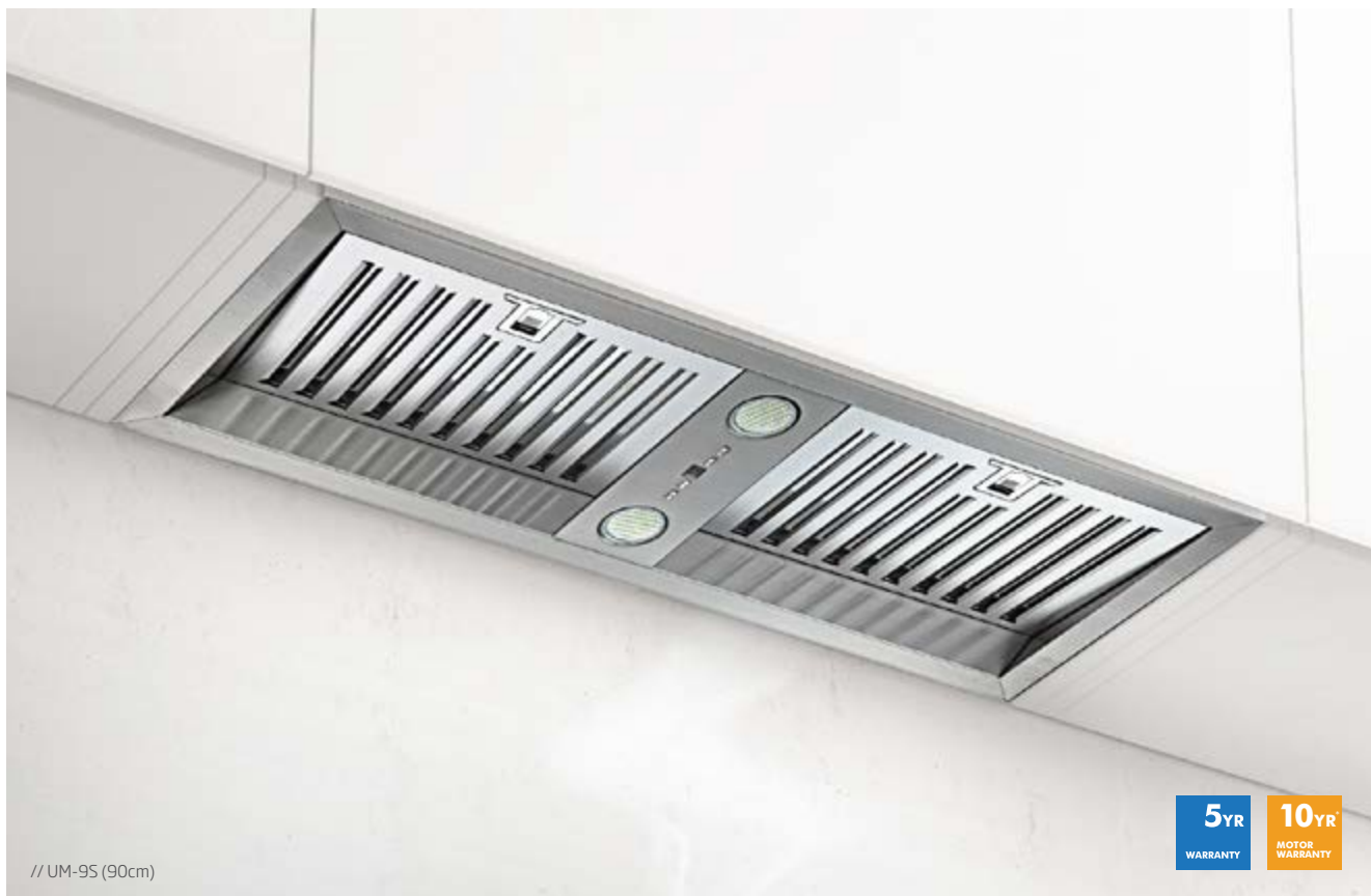
// UM-9S (90cm)