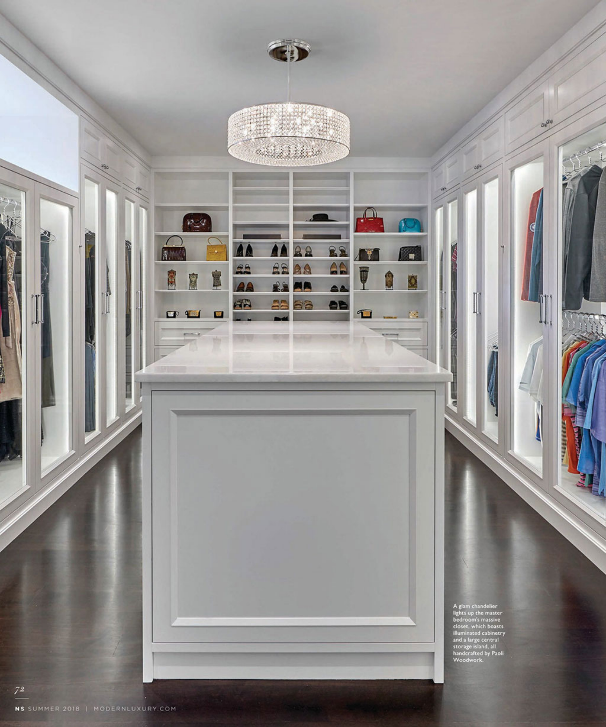
A glam chandelier lights up the master bedroom's massive closet, which boasts illuminated cabinetry and a large central storage island, all handcrafted by Paoli Woodwork.