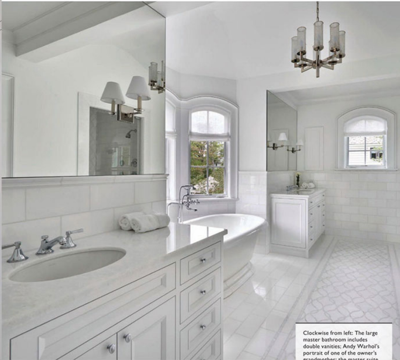
Clockwise from left: The large master bathroom includes double vanities; Andy Warhol's portrait of one of the owner's grandmother; the master suite includes a seating area with a built-in daybed and chairs from Michael Taylor covered in woven silk from Pierre Frey.