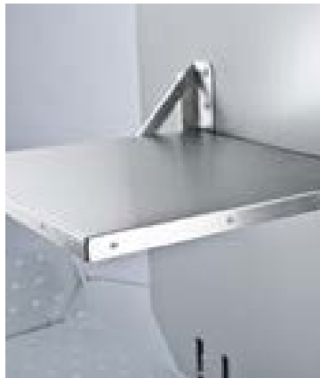
OPTIONAL FOLDING SEAT

With a push of the button you can summon the lift to the desired landing.