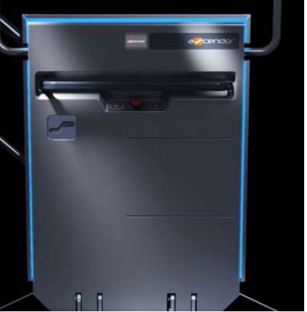
Choose a colour for the indirect, wraparound LED lighting, improves the individual adaptation into existing surroundings.