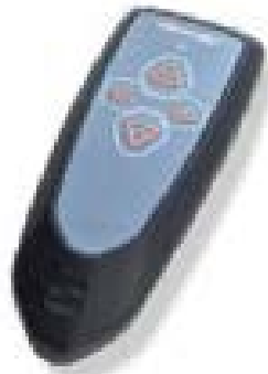
PORTABLE HANDHELD REMOTE CONTROL

Ideal for outdoor installations or for use in public buildings.