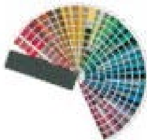
SELECTION OF FINISHES

With a push of the button you can summon the lift to the desired landing.