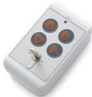
LOCKABLE, SECURE WALL MOUNTED REMOTE CONTROL

Ideal for outdoor installations or for use in public buildings.