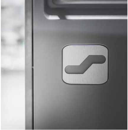
The integrated handrail blends harmoniously into the lift and has allowed us to produce a particularly slim design.