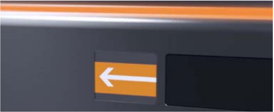
The graphic display panel will keep you up-to-date regarding the operating status of your lift and gives practical information and advice.

Select one of our design options or present us with your very own personal design, thereby transforming your lift into a work of art, which can blend harmoniously into its surroundings. Make your platform lift an extension of your own individuality.