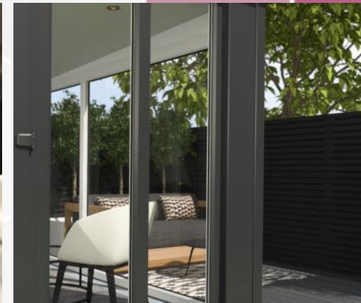
High thermal performance