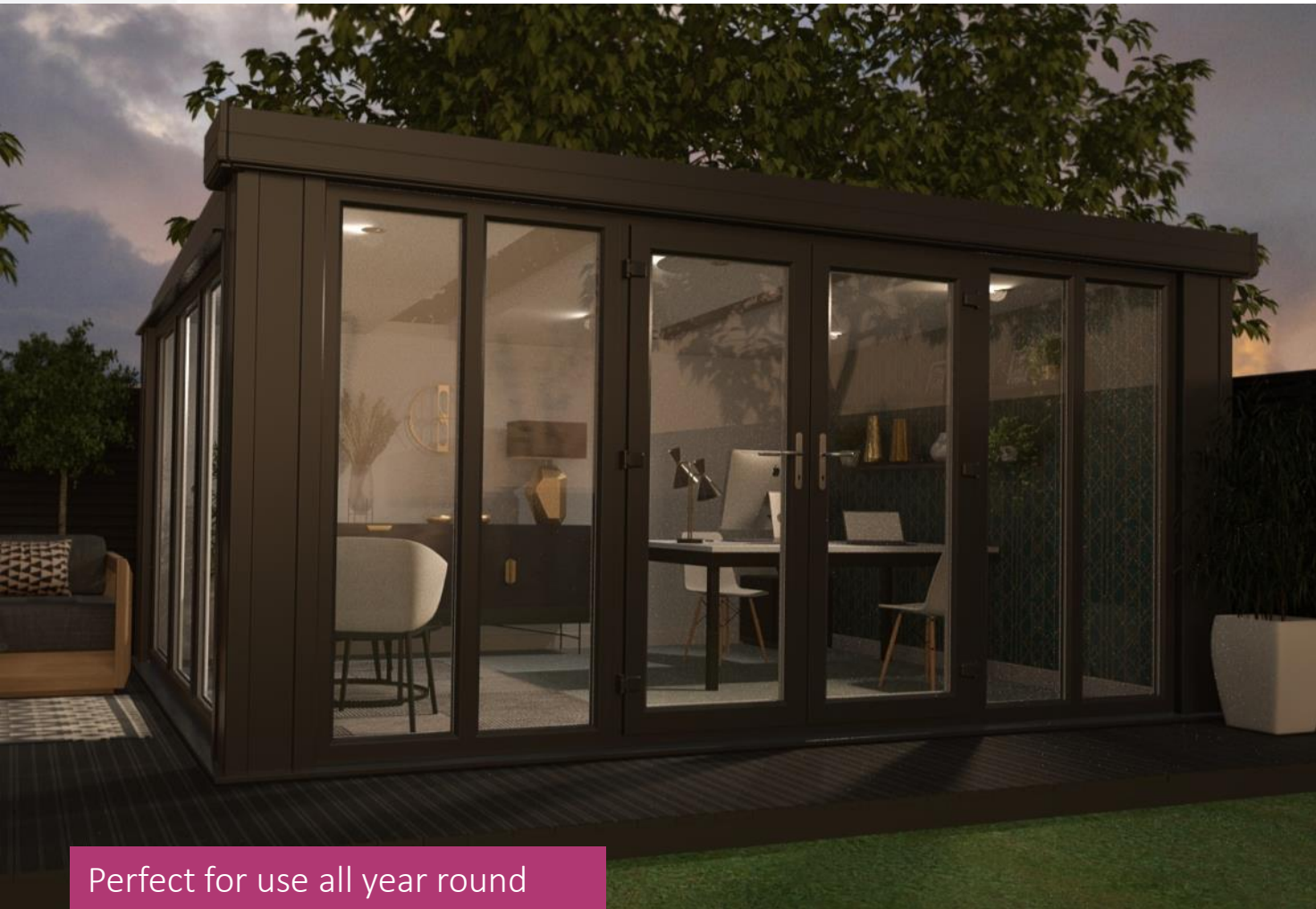
Perfect for use all year round