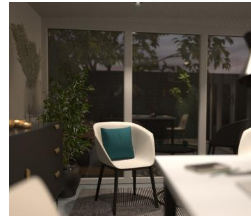
Full height glazing