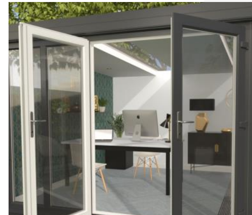
Flooded with natural light