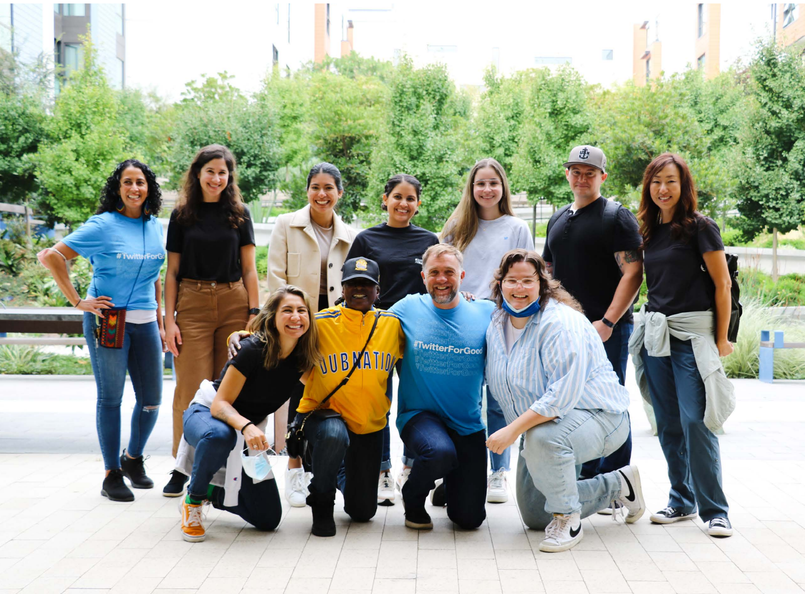
PHOTOS: Swords to Plowshares staff with Twitter volunteers and vet resident from Edwin M. Lee Apartments

This year, we saw the return of in-person volunteer events. While welcoming back old corporate partners, we are also making new connections with organizations that support our mission. As our community prepares for the winter months, our programming benefits from the generosity of committed partners.