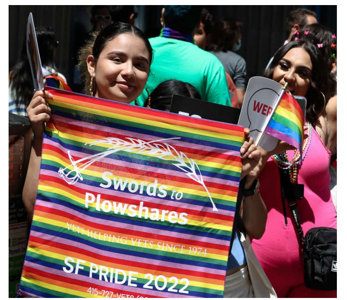
PHOTOS: Swords to Plowshares staff and Pride parade participants

As the Bay Area continues to adjust and re-open after two years of the COVID-19 pandemic, we amplify our commitment to serve all veterans. Our Legal Unit is ready to provide support and connect LGBTQ+ veterans with the services they need to access the benefits they deserve. There is still important work to be done, and we are proud to continue advocating for the rights and wellbeing of LGBTQ+ veterans.