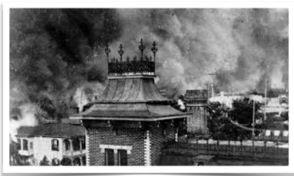
How Should We Convey the History of Jacksonville? Monuments, Parks, and People