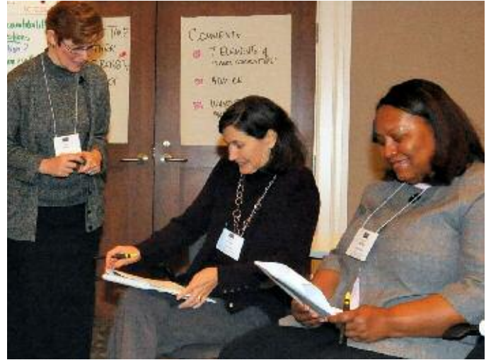
During the 2008 asset conference, teams of representatives from the Fund's five core communities worked with consultants and in small groups to develop strategies for building assets of low-wealth people.