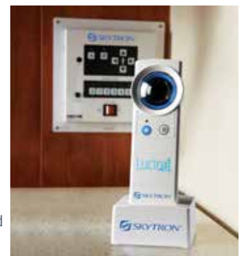
LED Strobe-Guided Positioning Wand and Wall Mounted Intensity Control