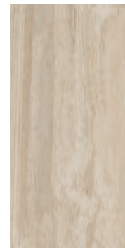
24" x 48" RECTIFIED