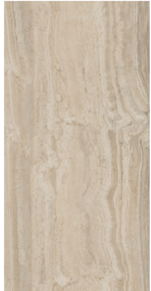
64" x 128"* RECTIFIED