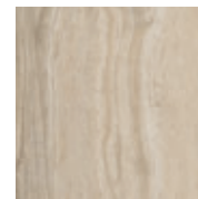
24" x 24" RECTIFIED