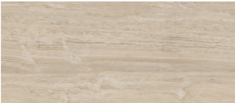
48" x 110" RECTIFIED