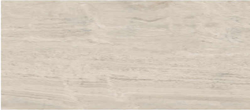
48" x 110" RECTIFIED