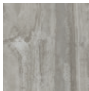
24" x 24" RECTIFIED