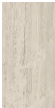
24" x 48" RECTIFIED