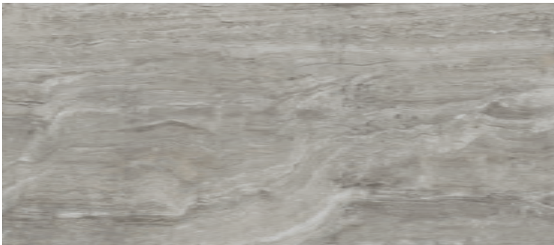
48" x 110" RECTIFIED