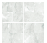
3" x 3" (12" x 12") MOSAIC, GLOSSY