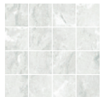
3" x 3" (12" x 12") MOSAIC