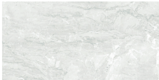
24" x 48" RECTIFIED