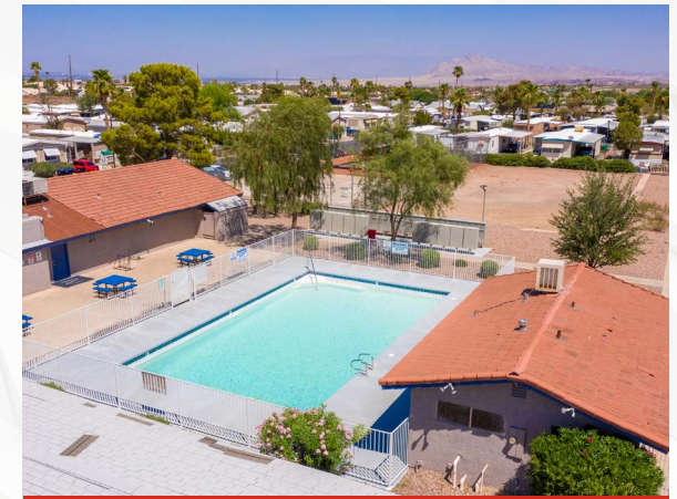
COMMUNITY POOL & SPA