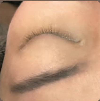
1 ST TREATMENT