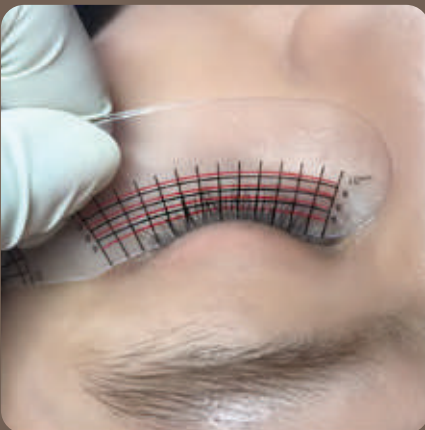
1 ST TREATMENT