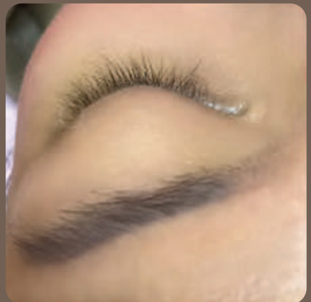
3 RD TREATMENT