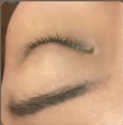
2 ND TREATMENT