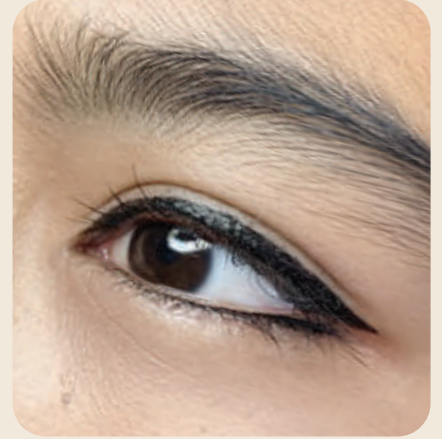
TOP & BOTTOM