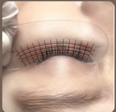
3 RD TREATMENT