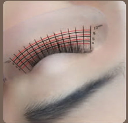
3 RD TREATMENT