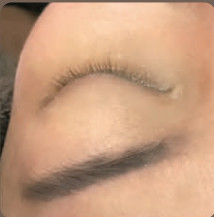
1 ST TREATMENT