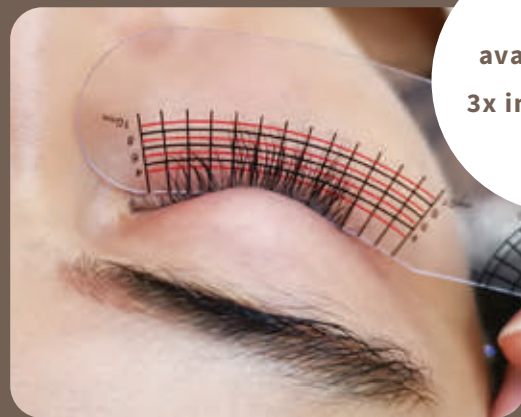
AFTER 3X STEM CELL LASH REGROWTH