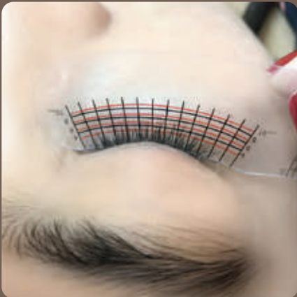
1 ST TREATMENT