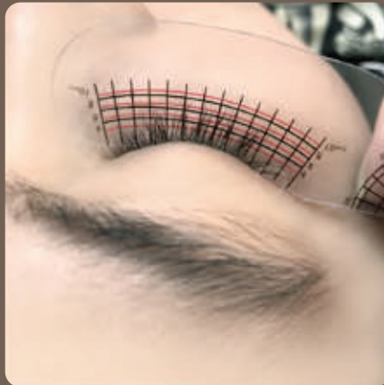
2 ND TREATMENT