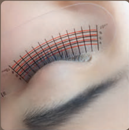
1 ST TREATMENT