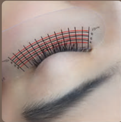
2 ND TREATMENT