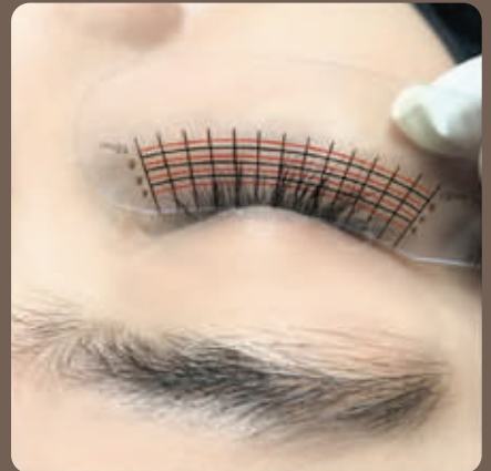
3 RD TREATMENT