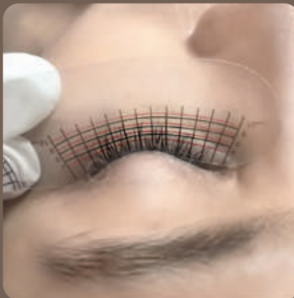
2 ND TREATMENT