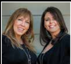
The Noonan Group 661-868-9043 DRE #01873759