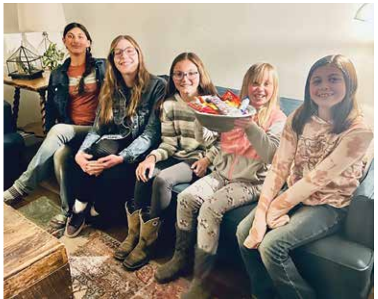
Several of our members during an unmounted lesson movie night.

Our local club has gone through many changes through the years. For a long time, it was primarily a hunter-jumper club. These days, we have young riders who ride in a wide variety