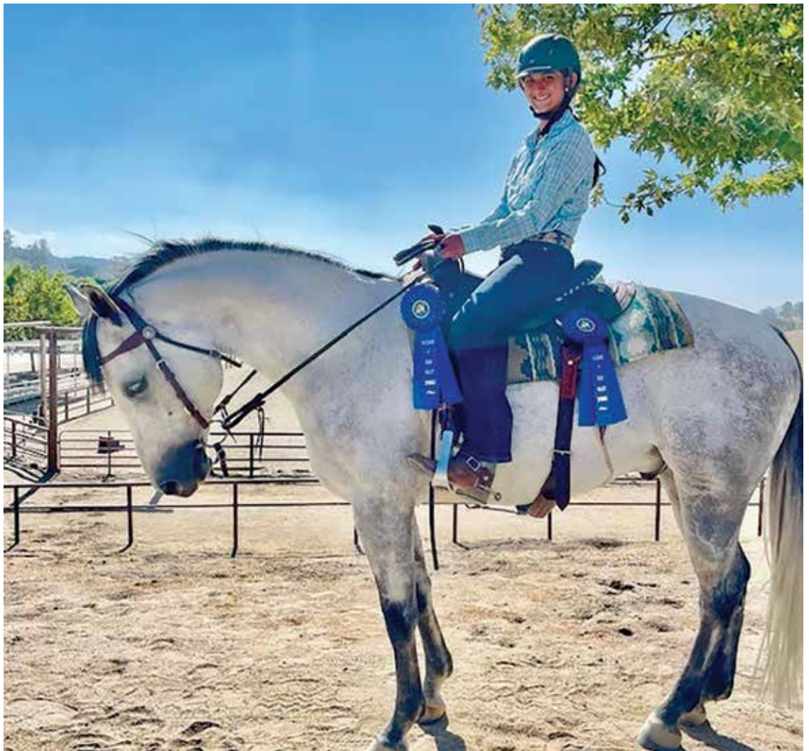
Confidence in the saddle translates to confidence in life.

I have often been asked by families if buying a horse for their child would be a good idea. Everyone's situation is unique and certainly owning one is not going to be a good fit for everyone, but I can absolutely recommend horses to any parent who wants to teach their child priceless life skills and equip them with character traits that will serve them far beyond the arena or barn. Are horses costly? Yes! In every possible way: time, money, and energy. Responsible horse ownership is less of a hobby and more of a dedicated way of life. No one should get into horses without understanding that. But what about the return on that investment?