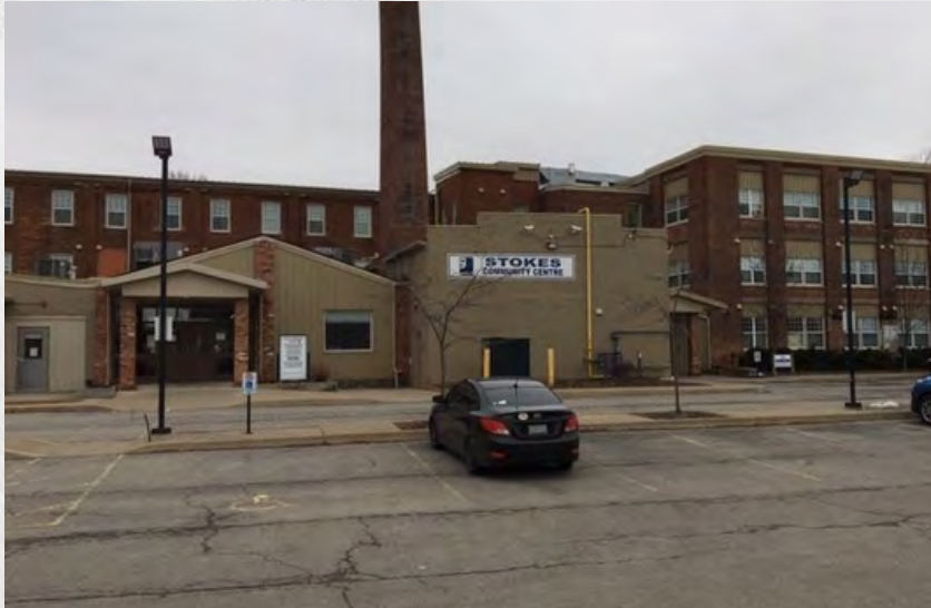
STOKES COMMUNITY BUILDING