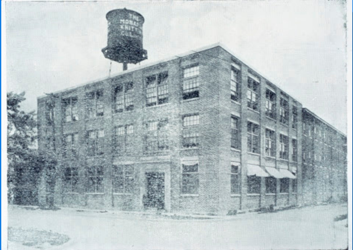
and photographed circa 1900's