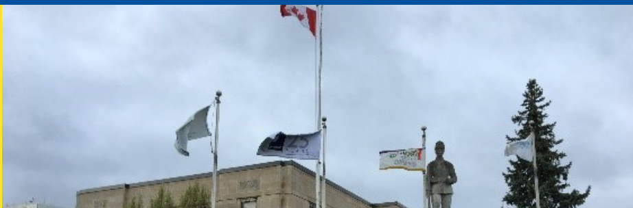
228 Glendale Ave-St. Catharines