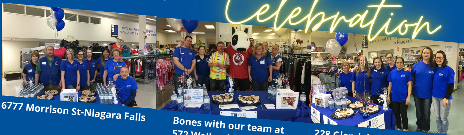
6777 Morrison St-Niagara Falls