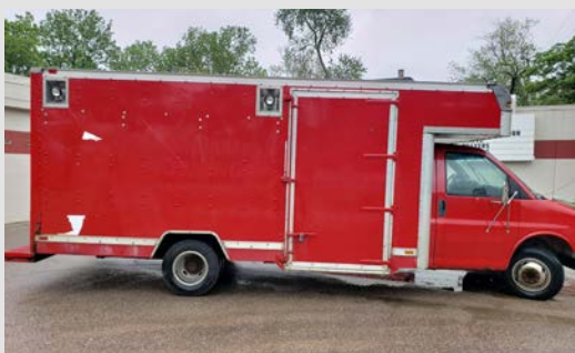
BEFORE NEW PAINT