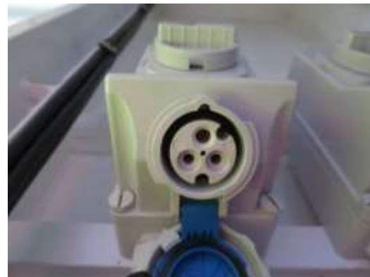
Reefer Connection type