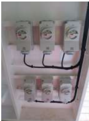
Reefer Connection SB