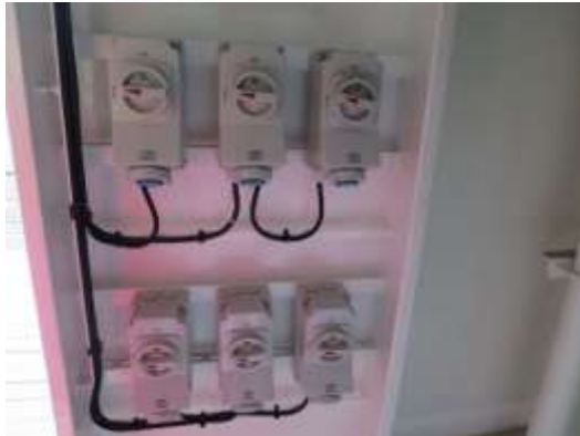
Reefer Connection PS

6 pcs 200V-260V 16A 2-phase+ground type QX7012 midship starboard side frame #39