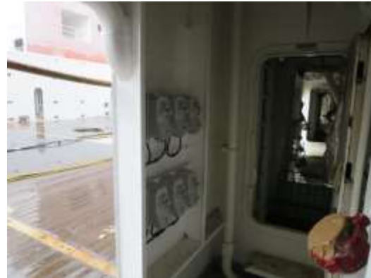
Reefer Connection PS