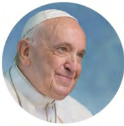
Pope Francis @Pontifex