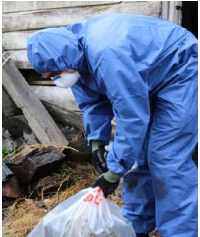
Always wear protective clothing when handling asbestos-containing materials and dispose of immediately afterwards

PPE is commercially available at construction suppliers, safety equipment retailers and some hardware chains.