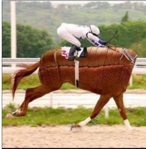
I've always wanted to own a pure bread horse

A bloke was standing by a kerb with his guide dog waiting to cross. The dog lifted it's leg and peed on the blokes leg. He bent down and began stroking the dog. A bloke standing next to him said - "why are you stroking him?" "To find out where his head is so I can kick his backside!"