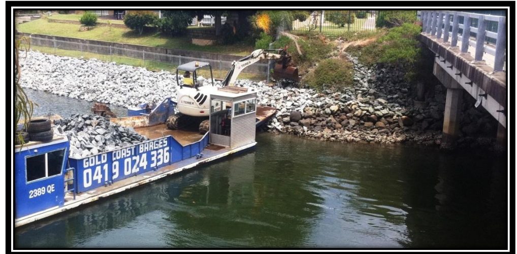
Rock work in action: Before - on right, after on left of this photo. Outstanding result.