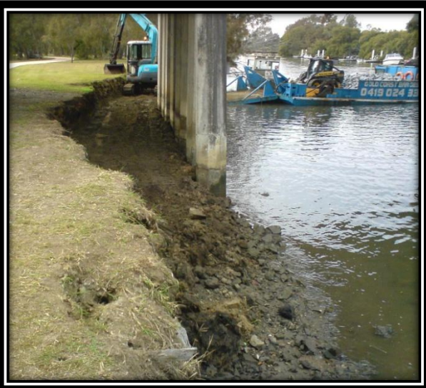
Saltwater Creek before Gold Coast Barges was engaged by GCCC to correct bank erosion issues.