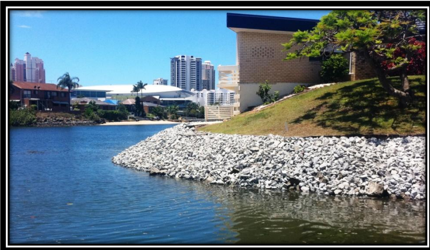
Miami Canal top up of rock armouring to slumping rock. Beautiful result .