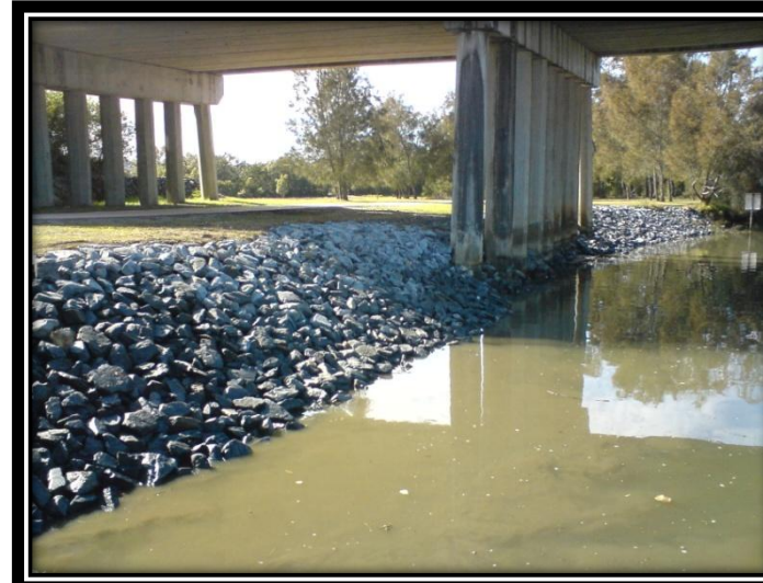
Saltwater Creek - after bank stabilisation by Gold Coast Barges with rock armouring.