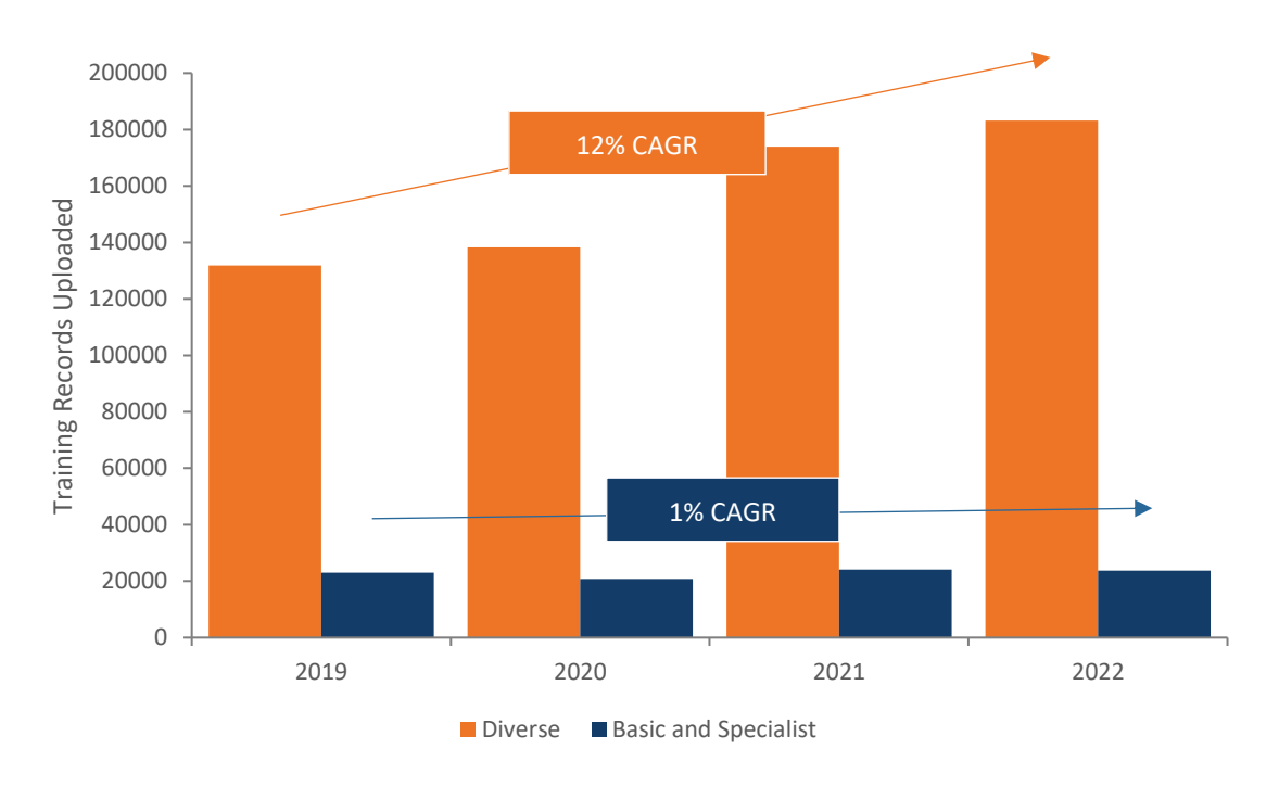
Figure 3, Three Year CACR Comparison Across Training Centre Types