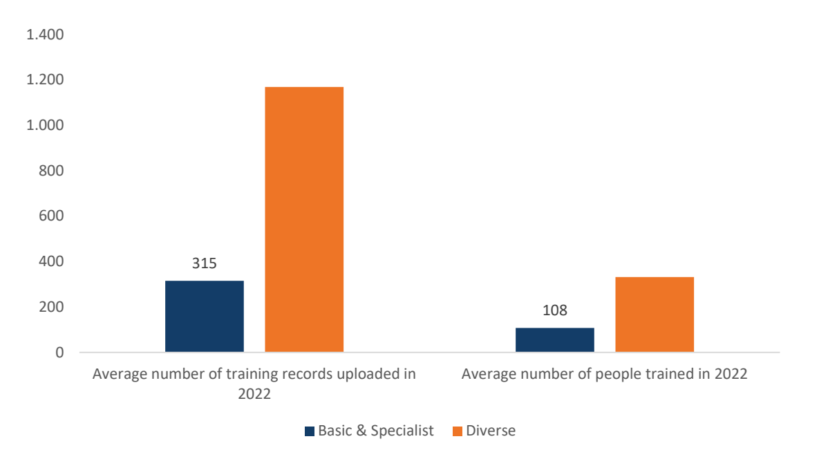
Figure 2, Average Number of Training Records Uploaded and People Trained in 2022 by Training Centre Type