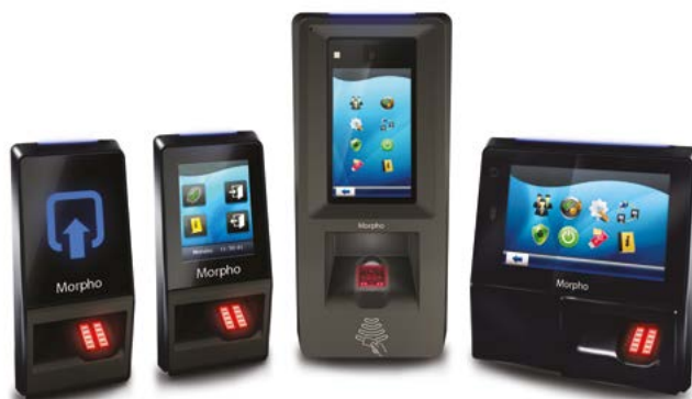
THE SIGMA FAMILY