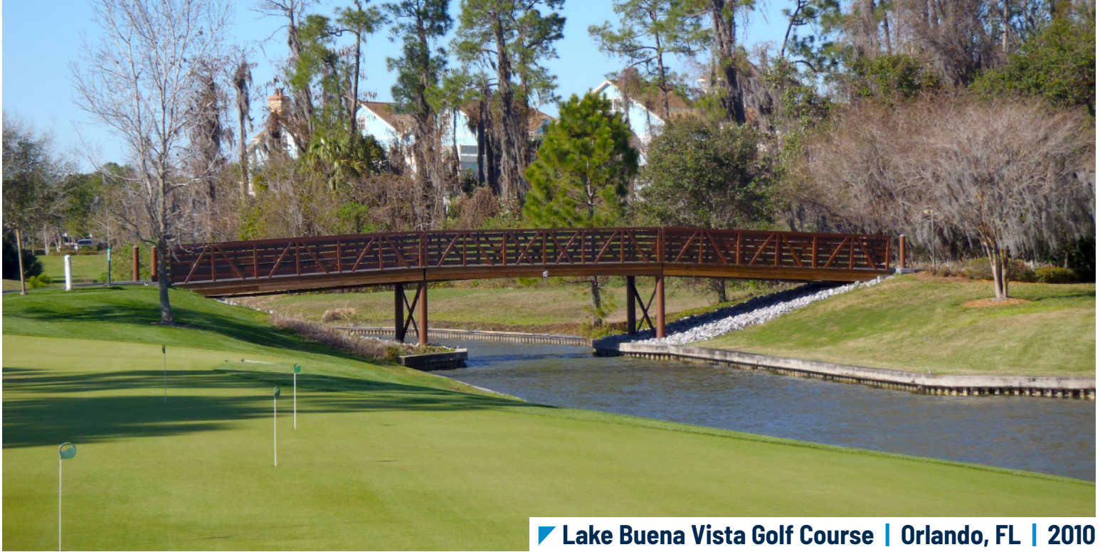
▶ Lake Buena Vista Golf Course | Orlando, FL | 2010