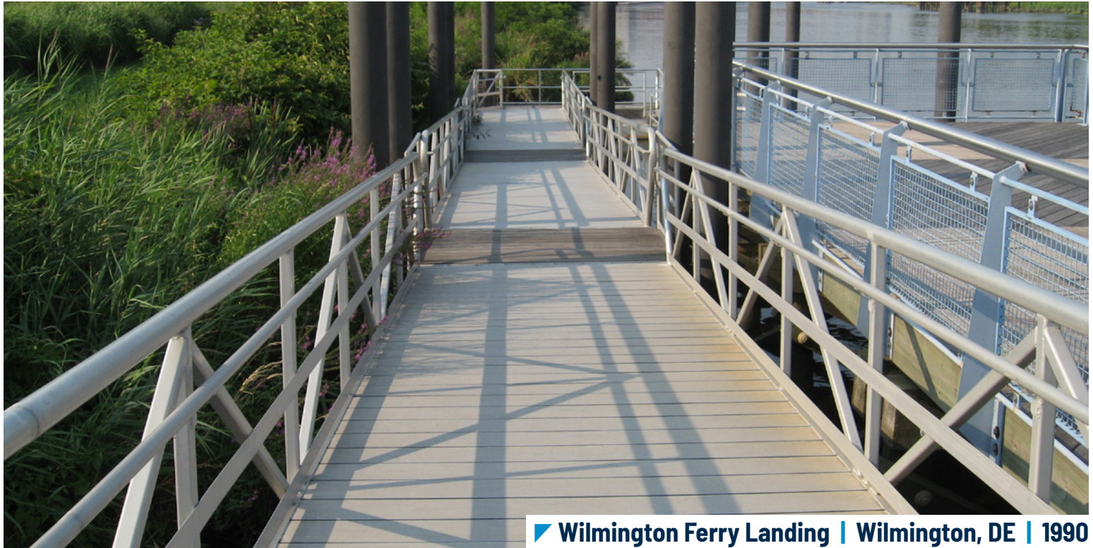
Wilmington Ferry Landing | Wilmington, DE | 1990

GatorBridge® Fabricated Aluminum Bridges