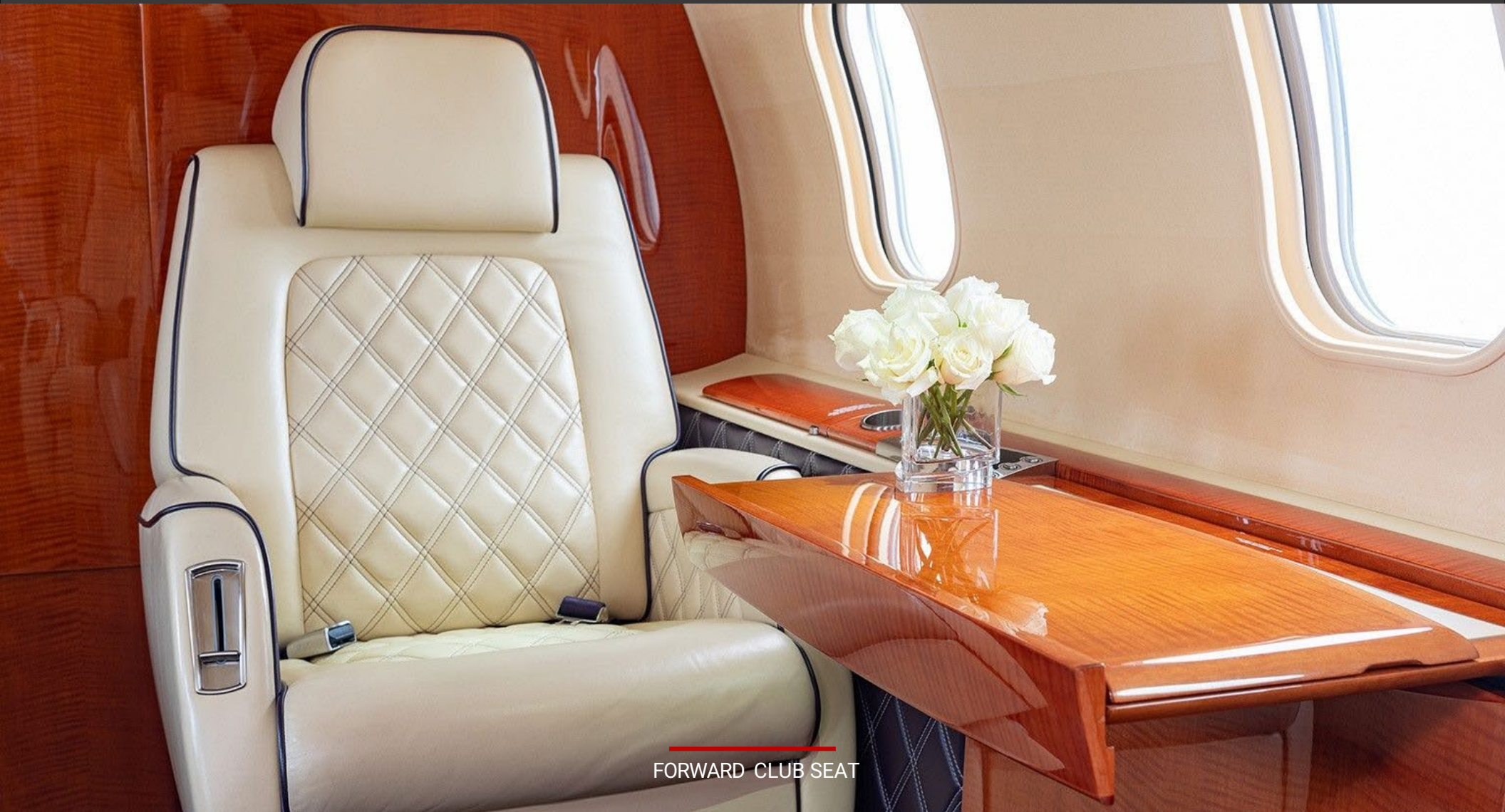
FORWARD CLUB SEAT

info@jetedgepartners.com | +1 410 928 4022 | www.jetedgepartners.com