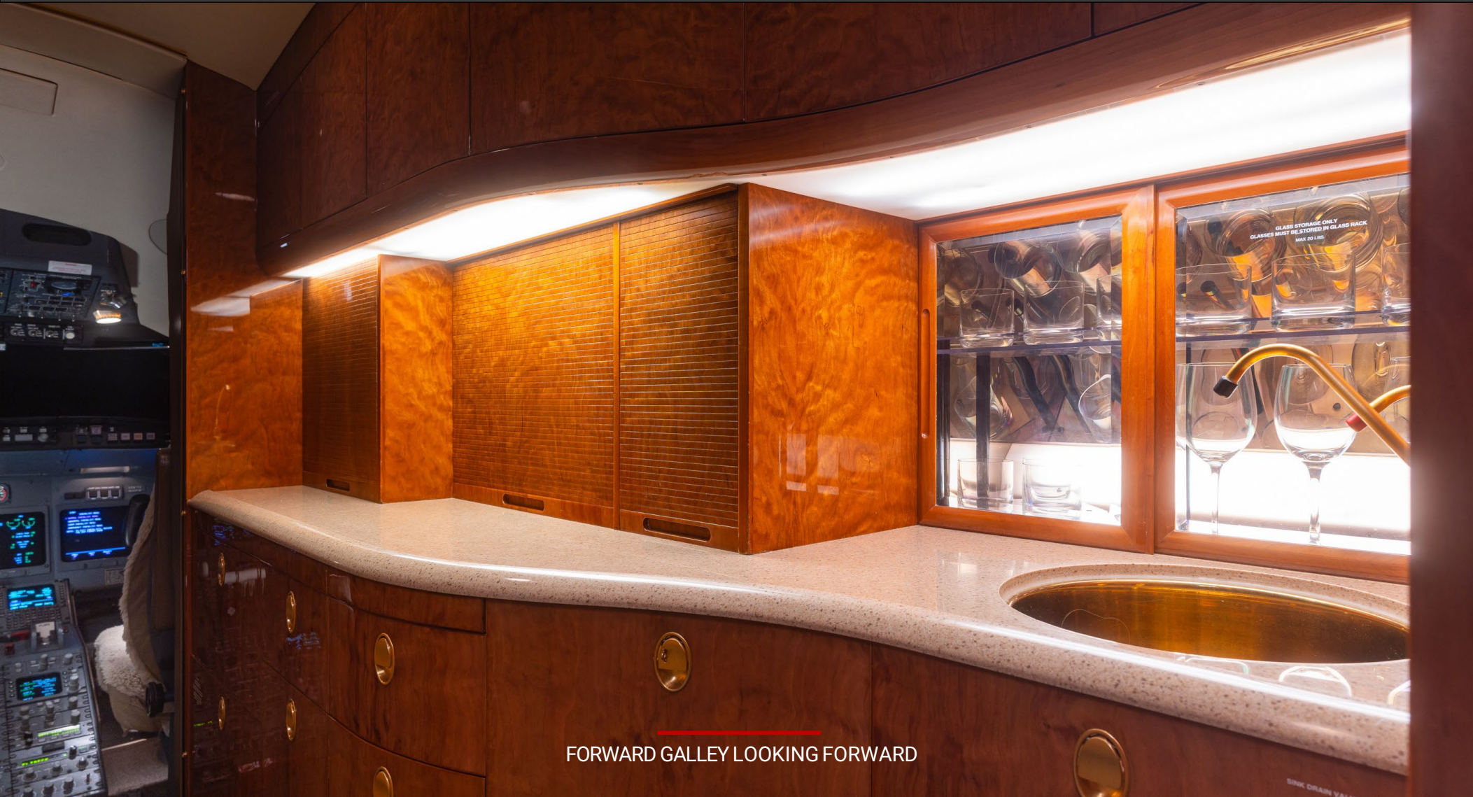
FORWARD GALLEY LOOKING FORWARD

info@jetedgepartners.com | +1 410 928 4022 | www.jetedgepartners.com