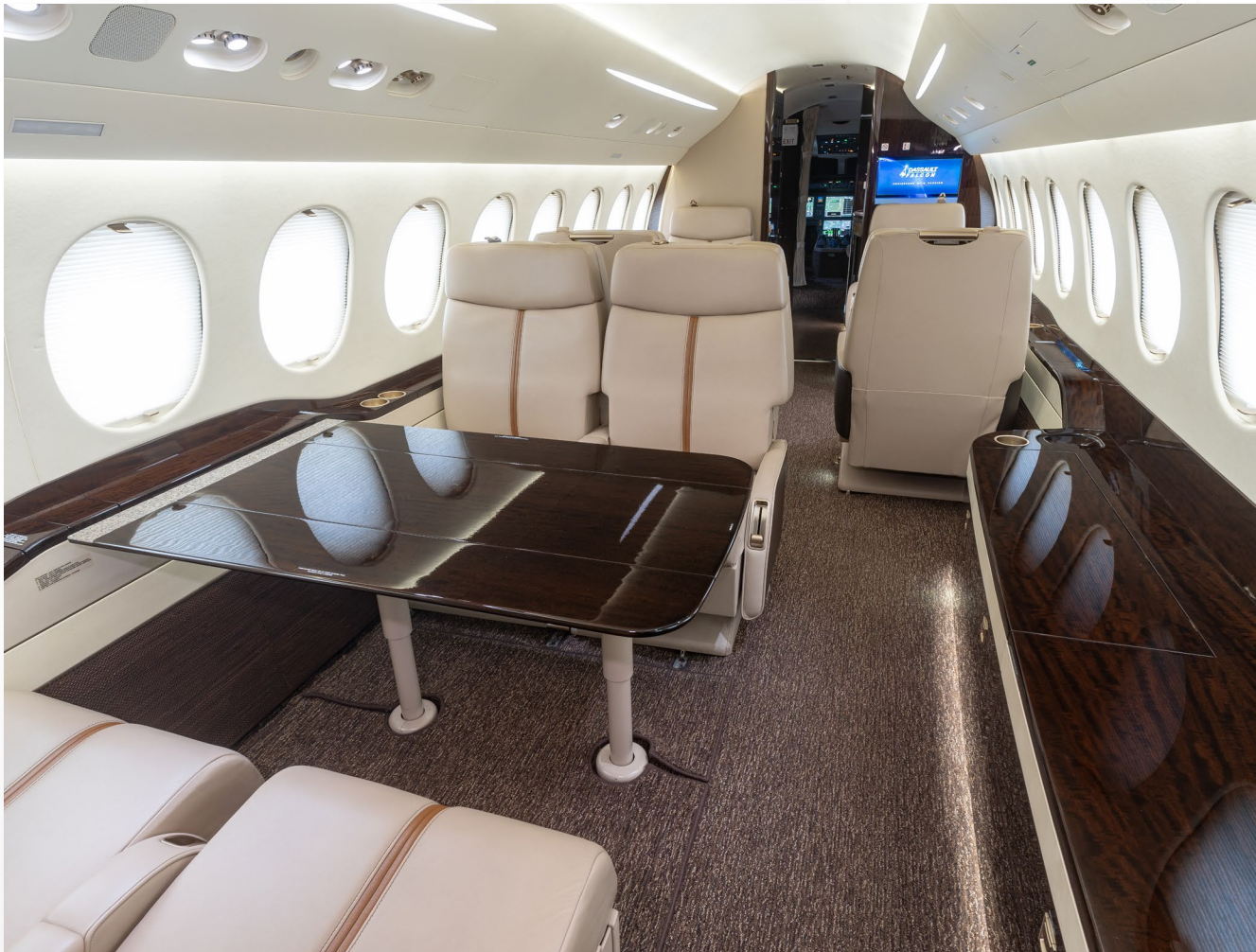
MID-CABIN DINING TABLE LOOKING FORWARD