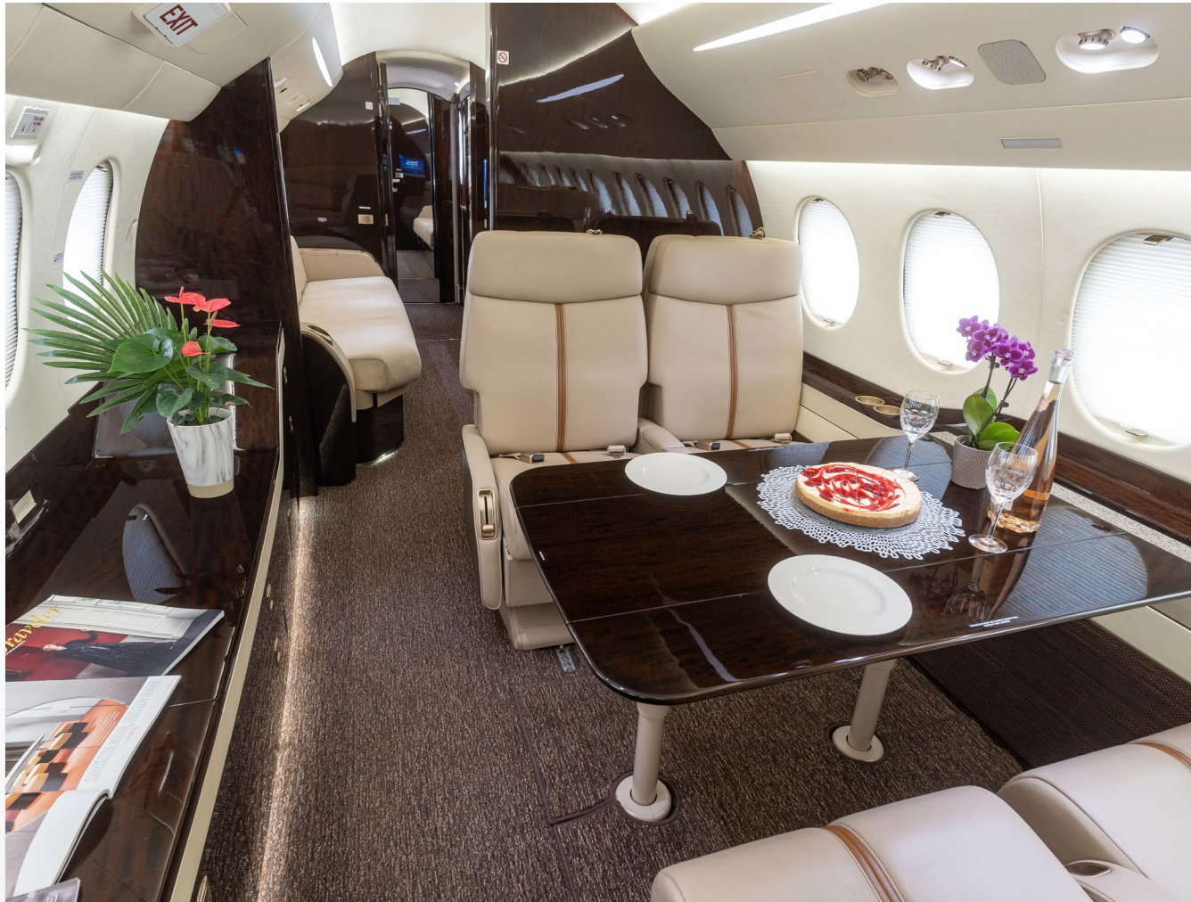
MID-CABIN DINING TABLE LOOKING AFT