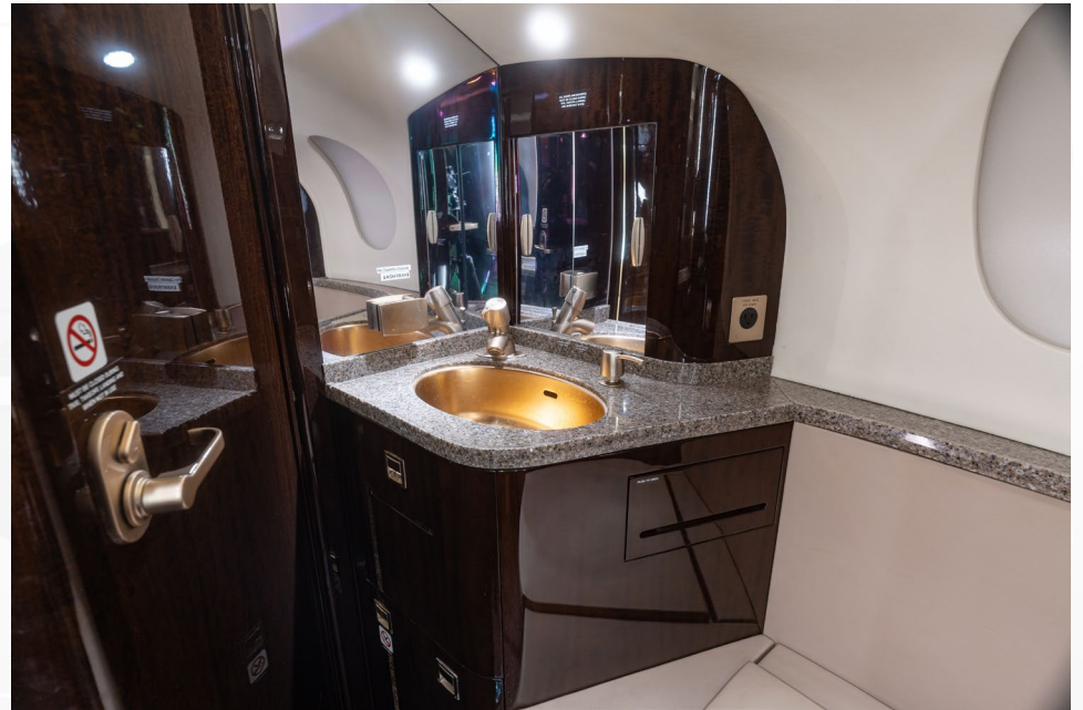
FORWARD AND AFT LAVATORIES