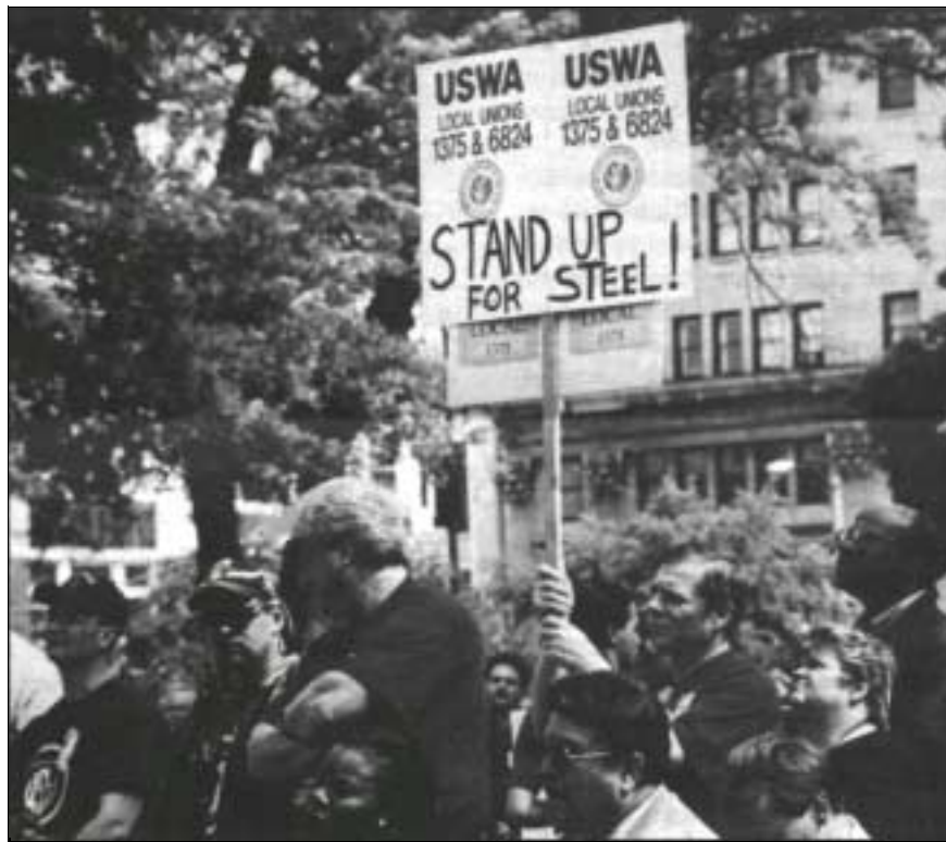
Steelworkers protest, Warren, OH, May 14, 2001

NSARI is administered by the Ohio Employee Ownership Center at Kent State University. To provide support and preliminary technical assistance to buyout efforts in the steel and aluminum industries, the OEOC has assembled a national network of non-profit and public sector partners with experience in the employee ownership approach to job retention. The program also can provide technical assistance to existing employee-owned companies in efforts to avert shutdown or major layoffs. Obtain more information by visiting our website: www.kent.edu/oec/NSARI.htm . OAW