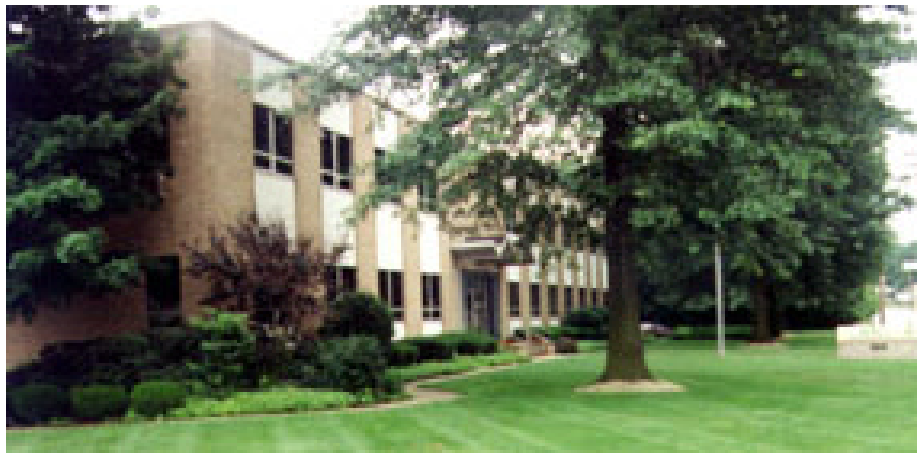
ACRT corporate Headquarters, Cuyahoga Falls