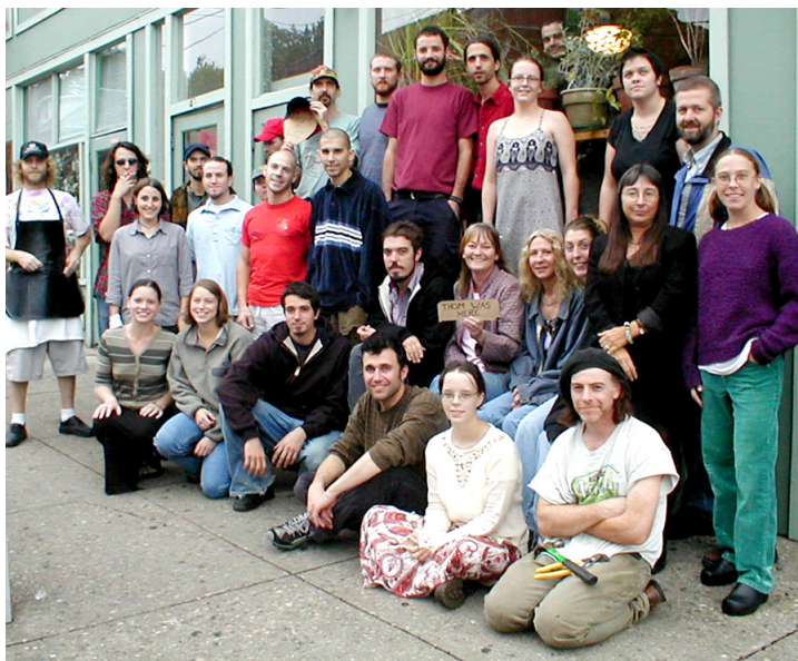
The owners of Casa Nueva pose in front of the restaurant.

"We stay on the forward side of the trend curve," explained Schaller. "Cooperative businesses are getting trendy again be-