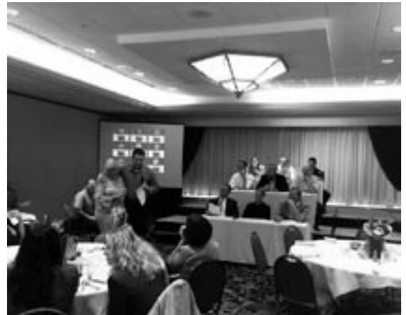
HDH Group Board of Directors participated in Hollywood Squares at last fall’s ESOP Workshop.

Stow-Glen’s 210 employees provide health