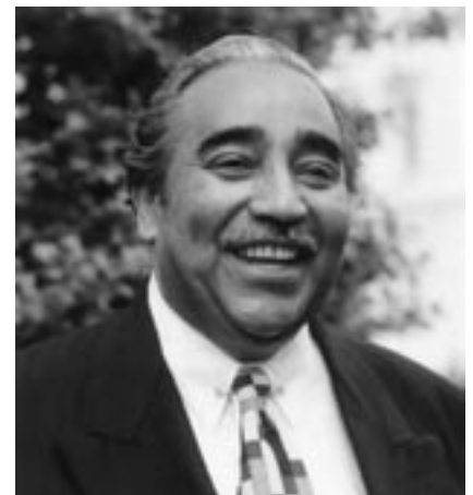
Congressman Charles Rangel of New York's 15th Congressional District