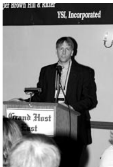
Ohio Treasurer Richard Cordray speaks at the meeting of the Ohio/Kentucky Chapter of the ESOP Association.