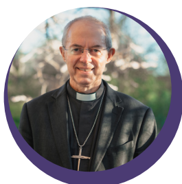
+ Justin Welby