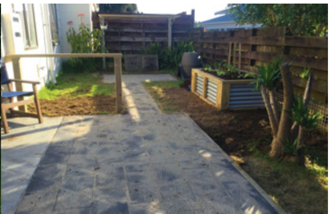
Before and after our Tauranga tenant's backyard transformation.