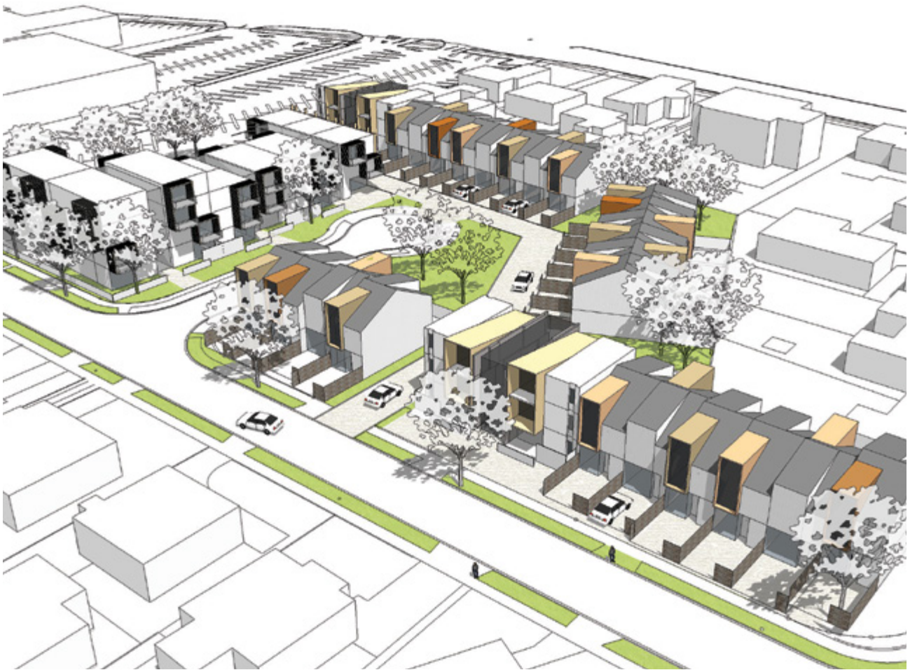
The Gate Pā "Pukehinahina Project"

Accessible Properties is hoping to replace 140 former state homes in Tauranga with more than 400 new townhouses and apartments.