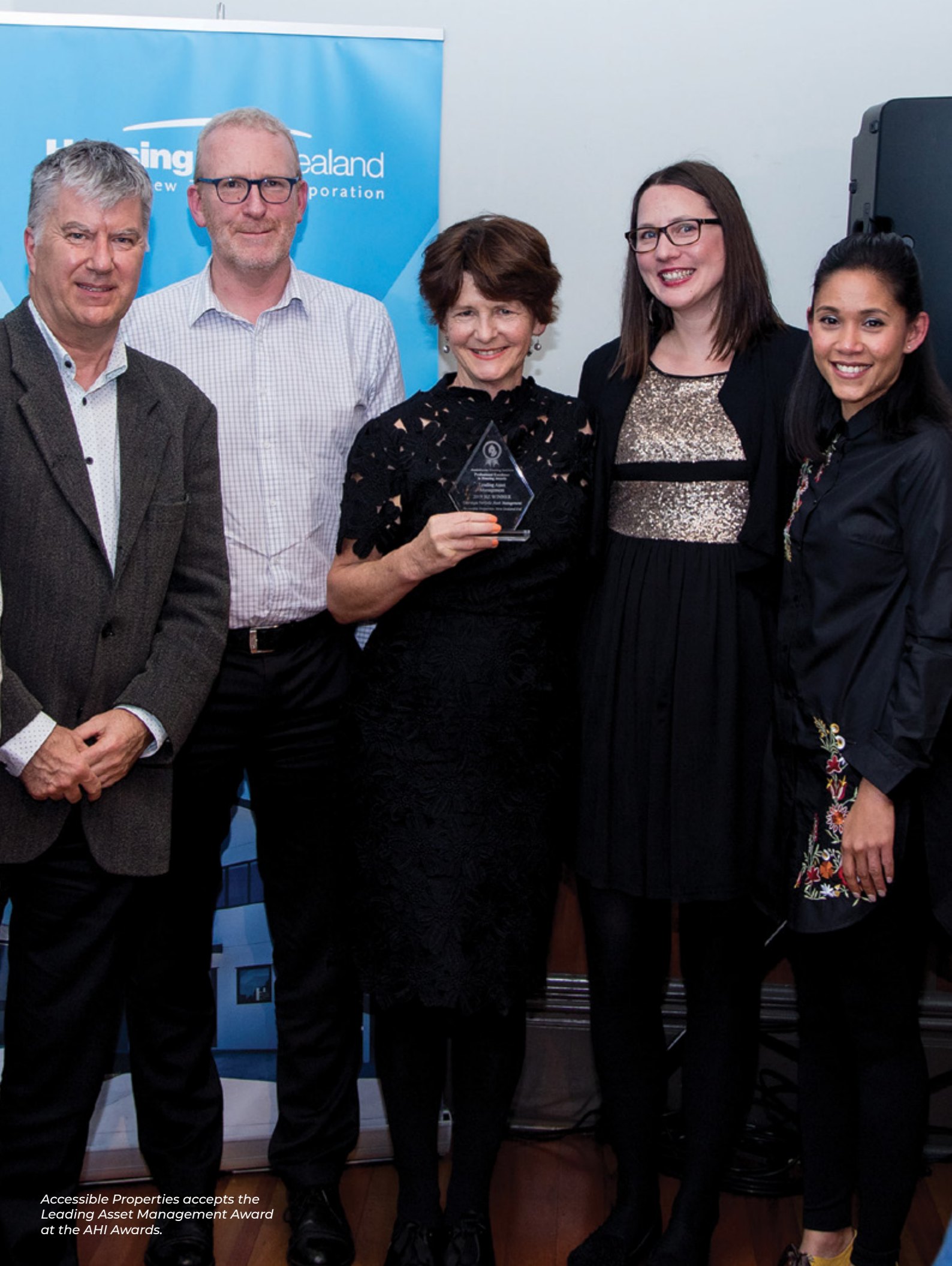
Accessible Properties accepts the Leading Asset Management Award at the AHJ Awards.