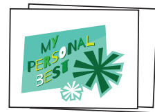
Decorations 4 Pages