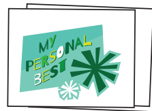
Decorations 4 Pages