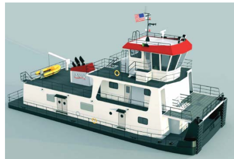
MiNO 82' inland towboat design Subchapter M compliant