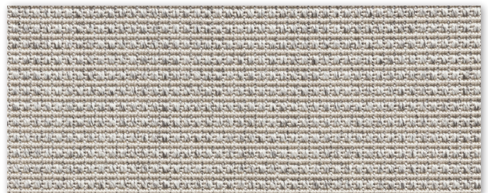
▲ 7305 / 35