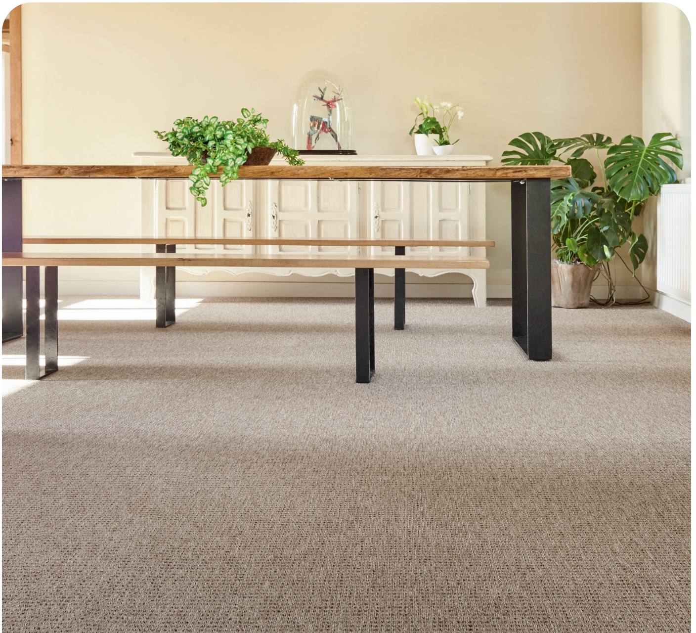
▲ 7305 / 32