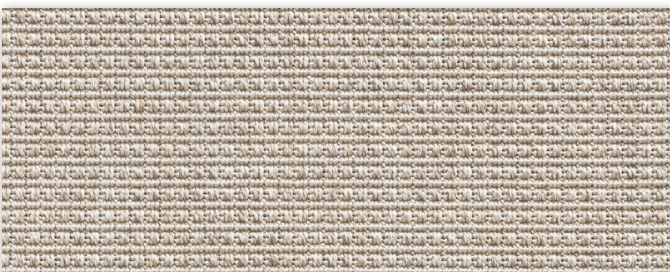
▲ 7305 / 34