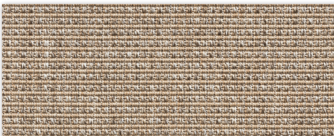
▲ 7305 / 32