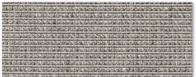
▲ 7305 / 36