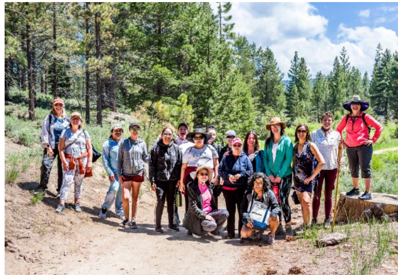
Community Outreach hiking group.

We strengthen community with our collaborating partners that include artists, poets, conservationists, educators, writers, art nonprofits and environmental nonprofits. We create in a rural culture a community that inspires arts activity, provides economic activity with geotourism, supports a thriving art community, and inspires environmental awareness.