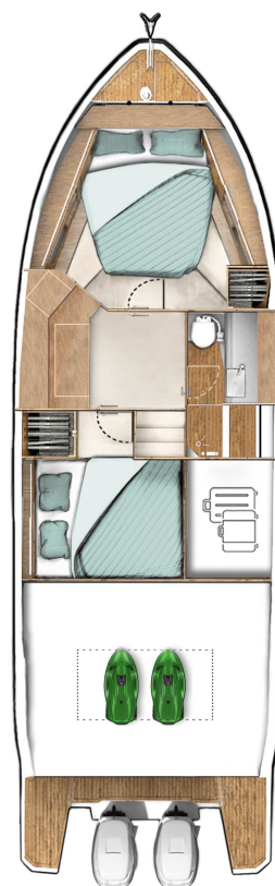
LOWER DECK standard