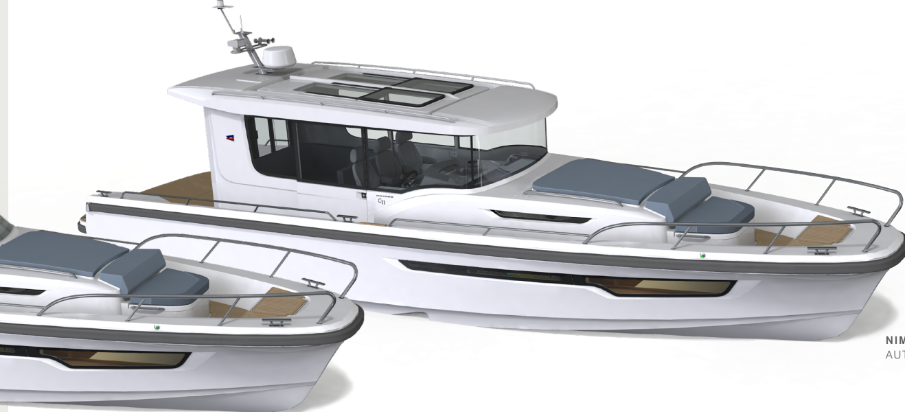
NIMBUS T11 SPRING 2019