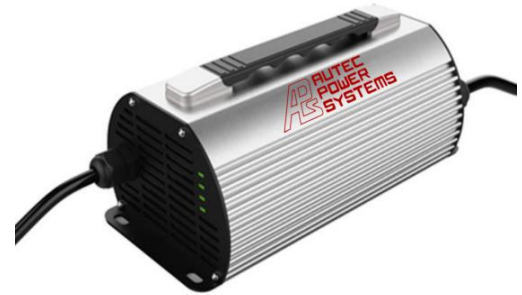
*Product images are for illustrative purposes only and may vary from actual design.