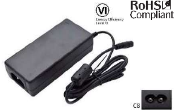
*Product images are for illustrative purposes only and may vary from actual design.