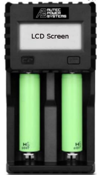
*Product images are for illustrative purposes only and may vary from actual design.