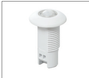
N100 Node VT-LINK