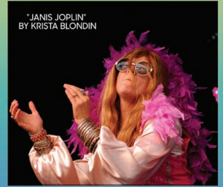
"JANIS JOPLIN" BY KRISTA BLONDIN

"AN ABSOLUTE DELIGHT TO WORK WITH - A LYRICAL, LITING TAKE ON HENDRIX"